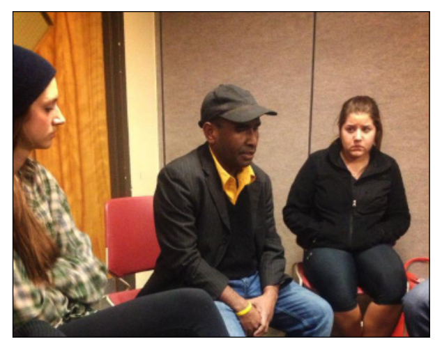
WGDP meeting.

awareness of the displacement crises happening around the world and connect students with internship and career opportunities with organizations that help those who have been displaced. This will be a two-day event comprised of building shelters out of recycled materials and hosting speakers.