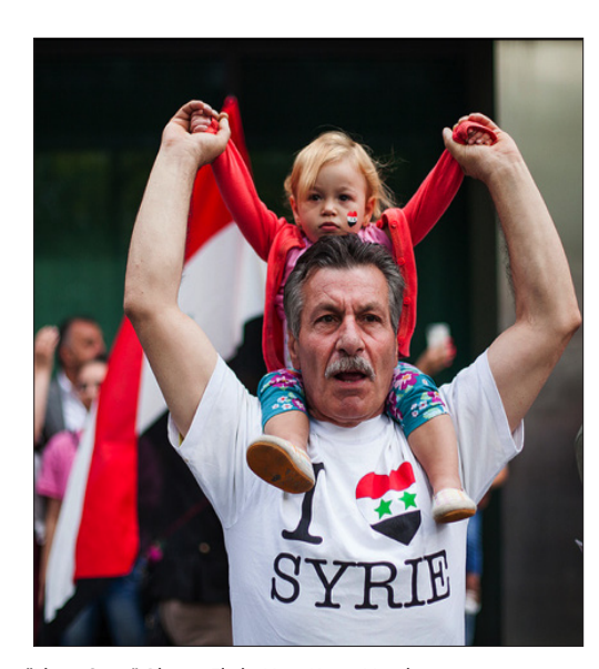
"I love Syrie".

I will describe these principles further in a moment. First, though, it is worth noting how inconclusive the debate has been over the three