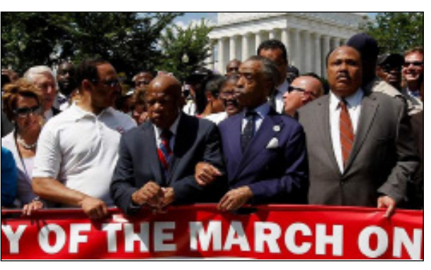
Some prominent participants at the 50th Anniversary of March on Washington.